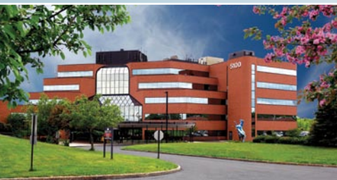
NMPC Headquarters in Liverpool, NY