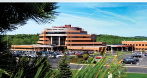
NMPC Northeast Facility in Fayetteville, NY